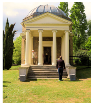
Garrick's Temple to Shakespeare, Hampton Museum Drop in 15th and 22nd September Unknown, 1756 GARRICK'S LAWN, HAMPTON COURT ROAD, HAMPTON, TW12 2EN