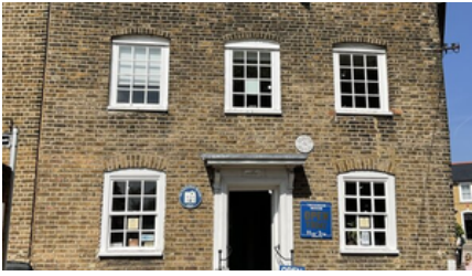
Twickenham Museum Museum Drop in 14th and 21st September Anthony Beckles Willson, 1720 25 THE EMBANKMENT, TWICKENHAM, TW1 3DU