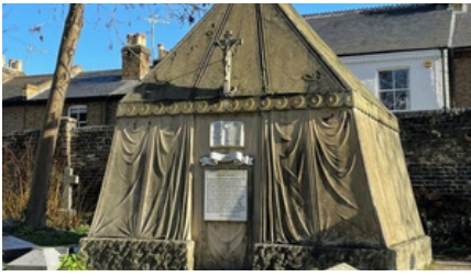
Burton Mausoleum Cemetery, religious Drop in 15th September Isabel Arundell Burton, 1890 ST MARY MAGDALEN'S RC CHURCH, TW9 1SN