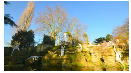
York House Historical house Drop in 22nd September Unknown, 1650 RICHMOND ROAD, TWICKENHAM, TW1 3AA