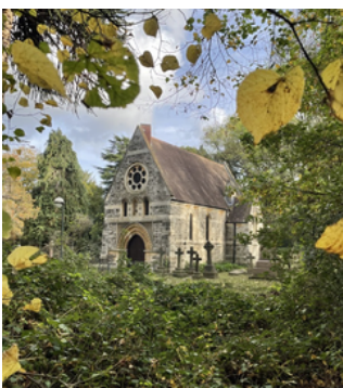
Grove Gardens Chapel Community/cultural, religious Drop in 15th September Sir Arthur Blomfield, 1875 RICHMOND CEMETERY, GROVE GARDENS, LOWER GROVE ROAD, TW10 6HP