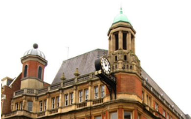
The Old Town Hall, Richmond Community/cultural Drop in: Guided tours 14th September W. J. Ancell, 1893 OLD TOWN HALL, WHITTAKER AVENUE, RICHMOND, TW9 1TP