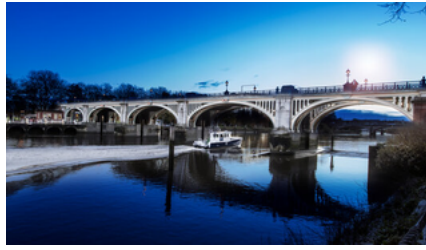
Richmond Lock Building (Surrey Side) Infrastructure/engineering Guided Tour 15th September Francis Goold Morony Stoney, 1891 THE TOWPATH, RICHMOND, TW9 2QJ