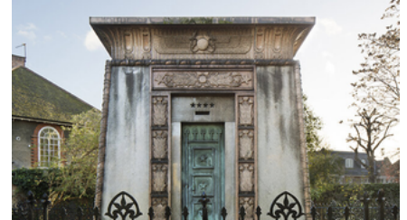
Kilmorey Mausoleum Cemetery, garden Drop in 15th September H. E. Kendall, 1854 275 ST MARGARET'S ROAD (OPPOSITE AILSA TAVERN), TW1 1NJ