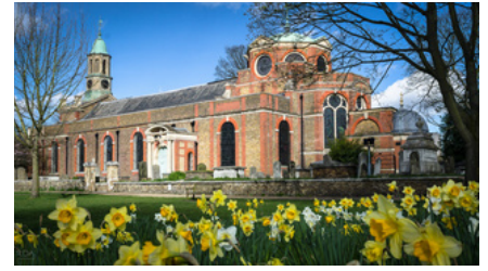
St Anne's Church, Kew Green Religious Drop in 14th, 18th, 19th, 20th and 21st September Unknown, 1714 KEW GREEN, TW9 3AA