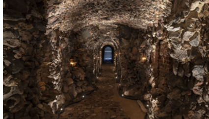
Pope's Grotto Historical house, monument, miscellaneous, community/cultural Open day 14th September Alexander Pope, William Kent, 1720 RADNOR HOUSE SCHOOL, POPE'S VILLA, CROSS DEEP, TWICKENHAM, TW1 4QG